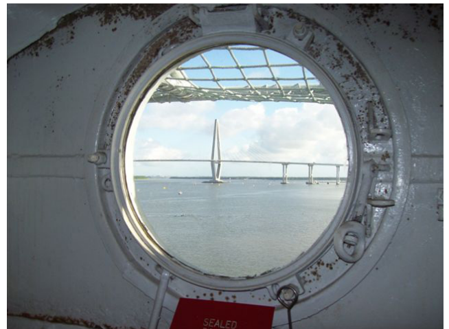
View of CooperRiver Bridge from Radio Room Portal