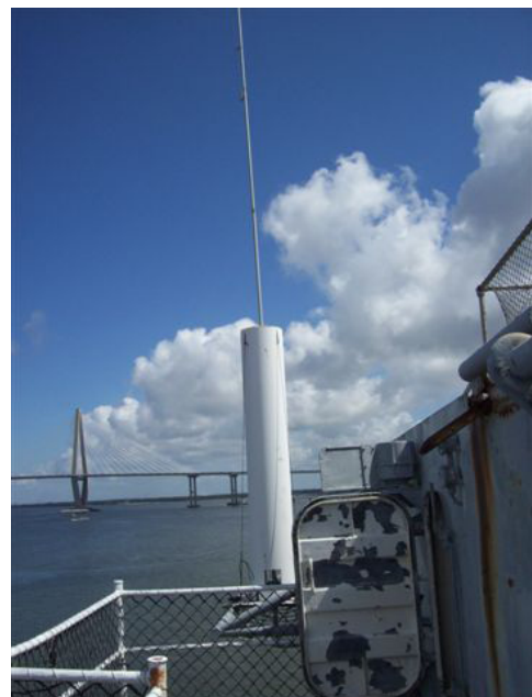
View of vertical antenna