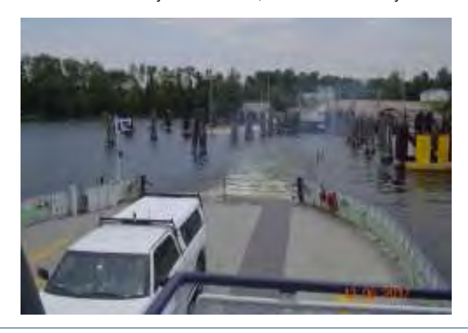
I was nearly last to board, but now under way.