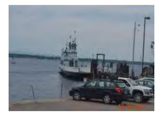
I was nearly last to board, but now under way.