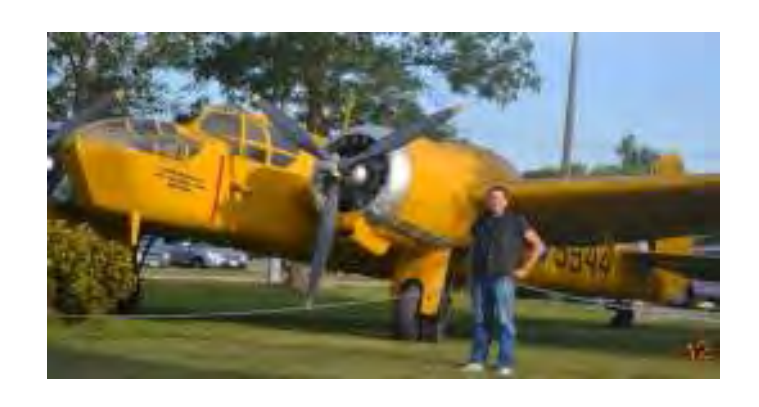
KU1V motel display of Avro Anson. www.bombercommandmuseum.ca/anson.html