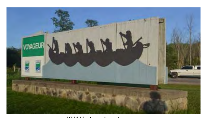
KU1V at park entrance.