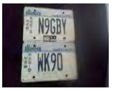
Herbert Scarpelli, WK90 13-FEB-17