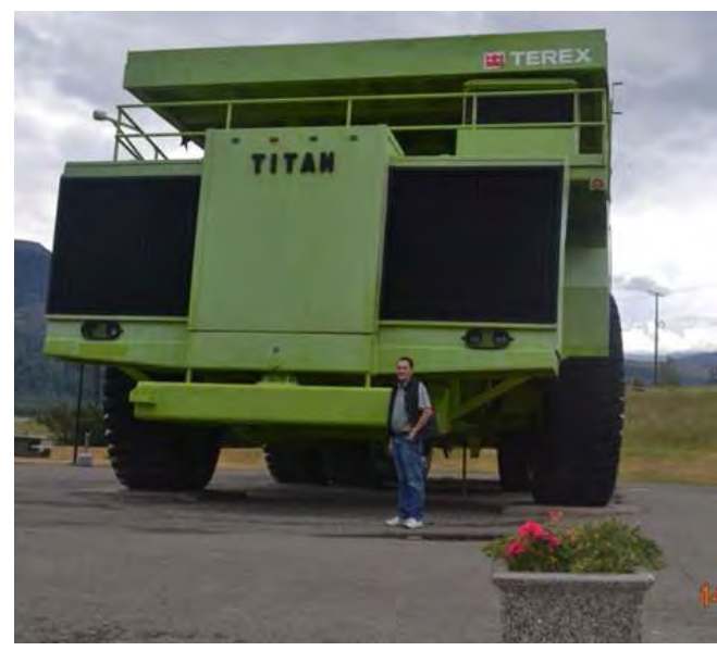
KU1V with Terex Titan.

www.wikipedia.org/wiki/Terex_33-19_%22Titan%22