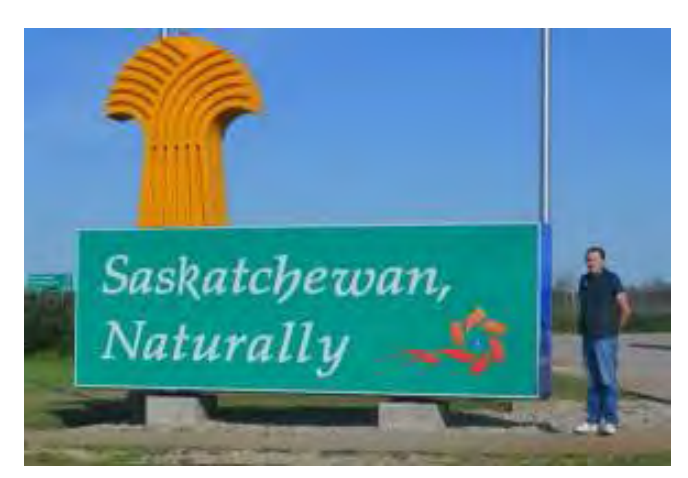
KU1V heading west, now in Saskatchewan