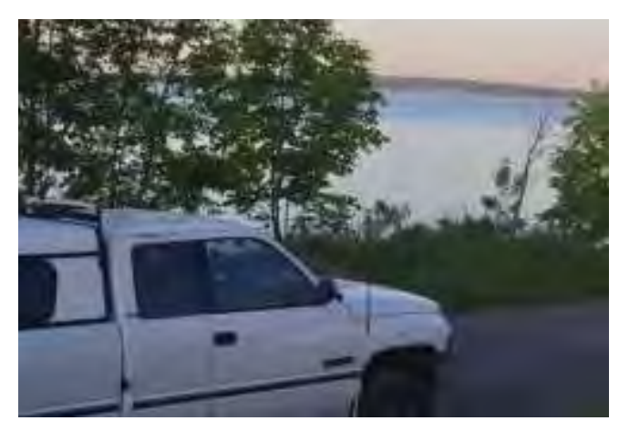
KU1V near Ottawa River, Point-Fortune Dam in the distance being the Hydo-Quebec Carillon generating station. <a href="https://www.hydroquebec.com/visit/laurentides/carillon.html">www.hydroquebec.com/visit/laurentides/carillon.html</a>

The next day, I took Trans-Canada Hwy to Ottawa for a visit to their wonderful aviation museum. If you are in the area you may wish to stop and see the fantastic display of Canadian Aviation Heritage.