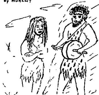
I THINK I'LL CALL IT "FIRE".

QSL cards - About 4% of the QSL cards I receive have Z time and LOCAL DATE (ocasionally, vice versa). Now, unless specifically requested otherwise, ALL QSLs for QSOs completed below 144 MHz should show both Z time AND Z date. This is customary throughout the amateur world. Also, every now and then, I get a QSL with different call-signs