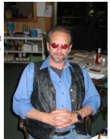
K2KI in St. Albans, Vermont during a fall trip to the Northeast.