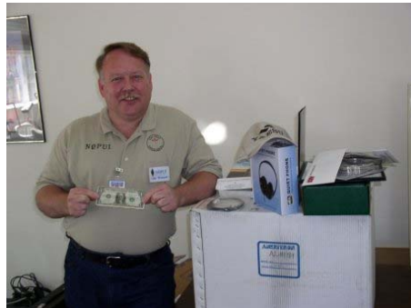
$1 wins lots of prizes for Jay—NØPUI.