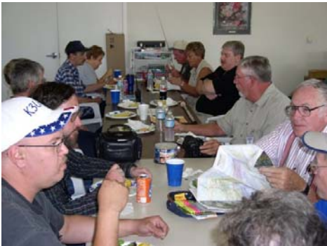
Above: One of the many meal gatherings.