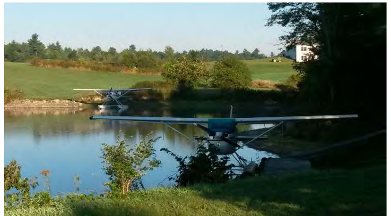
seaplane cove and me on the right.