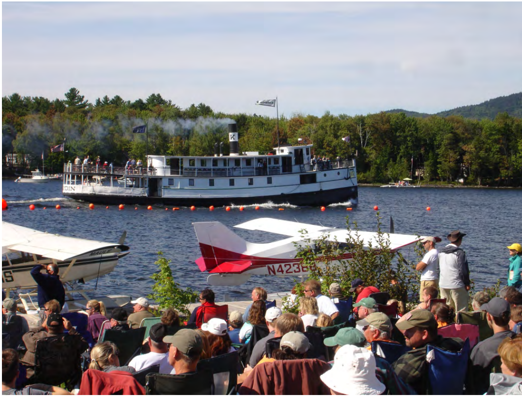
picture of event area, that ship is the Mt. Katahdin heading out for a lake tour.