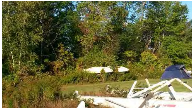
That's my blue hotel in picture