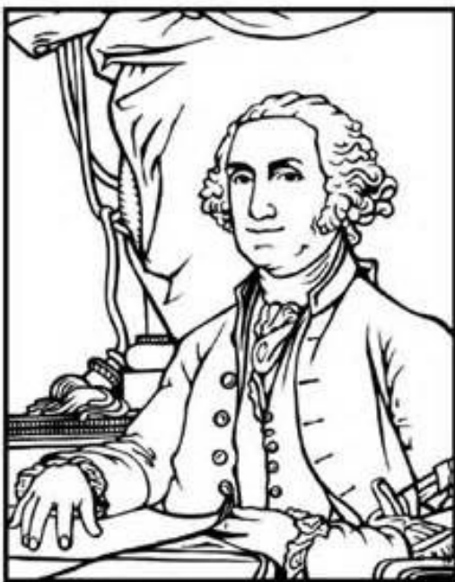
1. George Washington 1789-1797

Congratulations! Have Fun! Keep on Going!