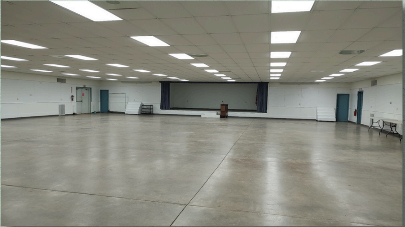
Photo of main auditorium