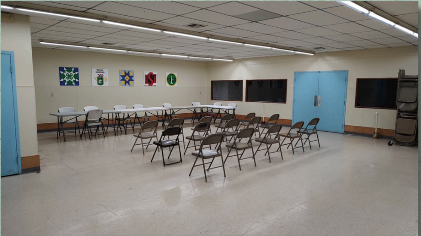
One of two small rooms