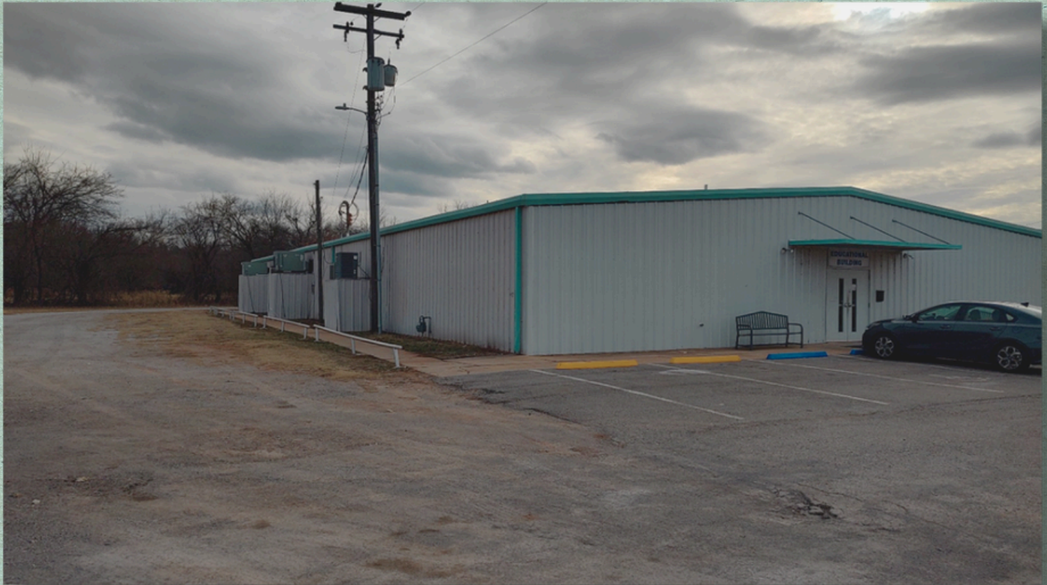
Front of Education building

The venue is the Logan County Fairground Education Building, 215 Fairground Rd, Guthrie, Oklahoma 73044. The building has it's own kitchen, a very large auditorium, and two smaller rooms. Since it is typically hot in August, there is plenty of air conditioning. This building has been used in the past couple months as a Red Cross Shelter during our record-breaking fire season and the floods a few weeks back.