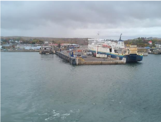
View of docking area and ferry in adjoining birth, NS