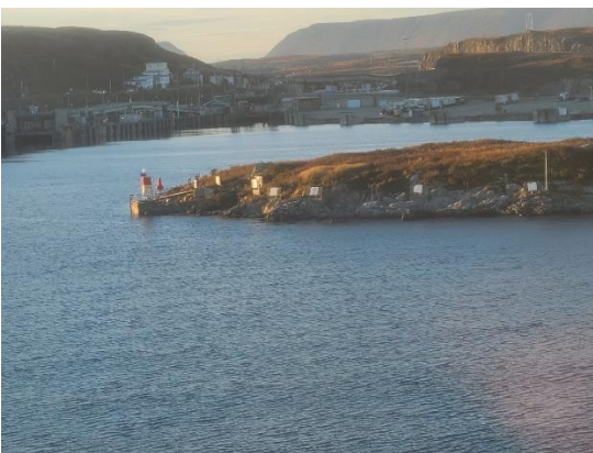
Approaching Port aux Basques, NL

Bringing a ship into Port aux Basques, NL, looks difficult as it requires maneuvering in a turning basin, positioning ship into docks stern first.