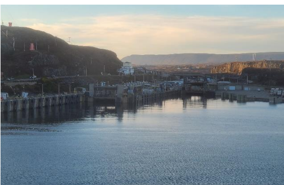
Birthing area Port aux Basques, NL

Sun light is fading fast and my next several hours will be night driving. Always concerned about animals on the road as there is a high moose population in NL. I arrive within the National Park in time to participate with the 40m EN and 40m LN. My accommodation in Gros Mourn National Park make an easy visit to the visitor center.