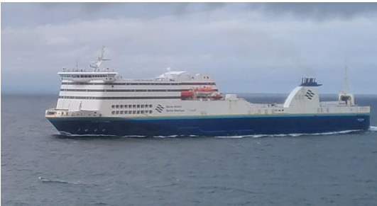
Passing another ferry enroute to NL

Bringing a ship into Port aux Basques, NL, looks difficult as it requires maneuvering in a turning basin, positioning ship into docks stern first.