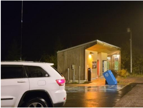
Terra-Nove NP, NL. Kiosk Center and rest area.